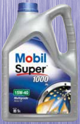
Part No. MOB-157307