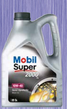
Part No. MOB-151187